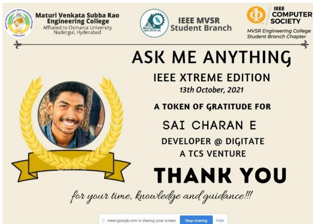
Virtual Memento of the speaker